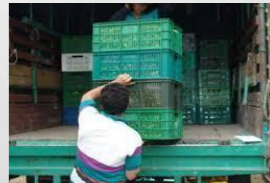
RECEPTION IN THE PLANT