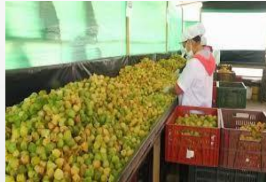
PRE-SELECTION IN THE FIELD